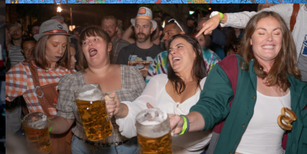
OktoberWest 2022