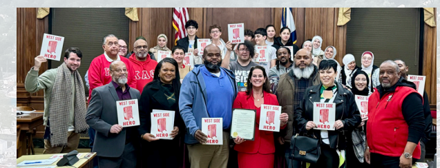
Some of the many "Gas Crisis Heroes" recognized by Charleston City Council in December 2023