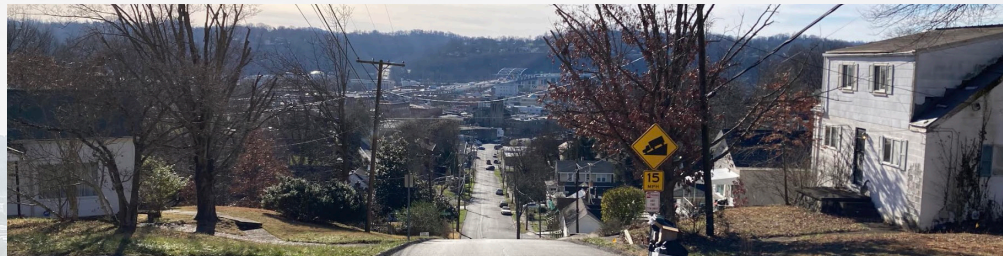
Watts Hill overlooking the West Side of Charleston

Read more "Project Spotlight West" and other stories at BlackByGod.org